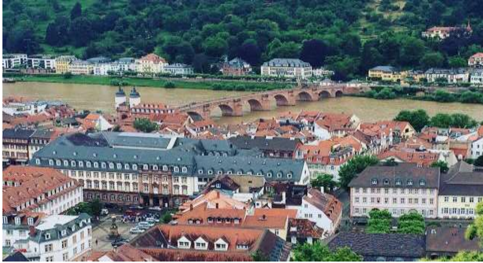
Visit of the Old town of Heidelberg and the famous Heidelberg Castle