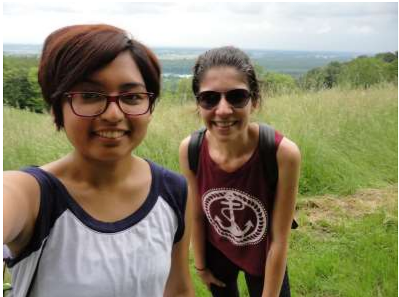
Hiking to the Michaelsberg near Bruchsal