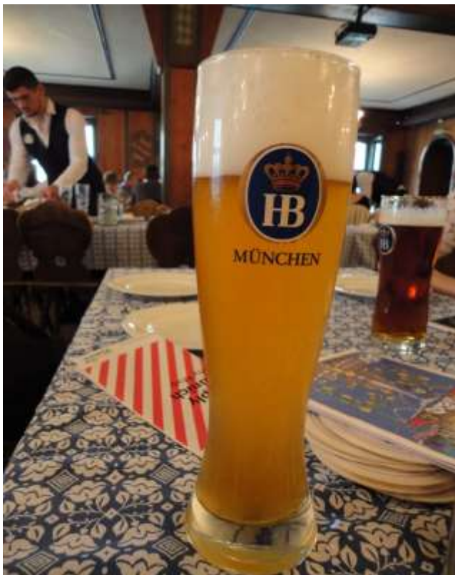
Traditional German lunch at Hofbräuhaus in Munich