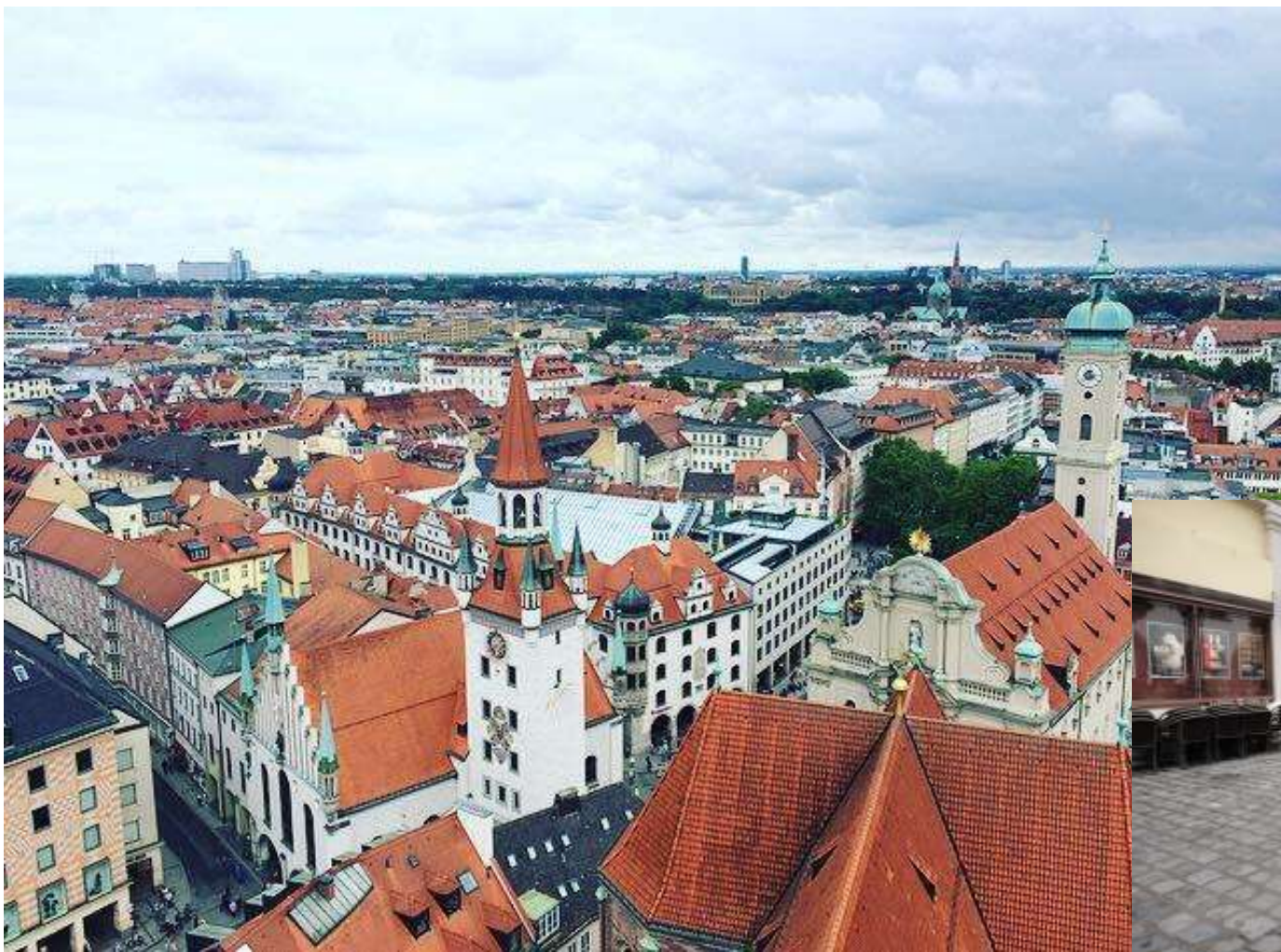
Visit of Munich city center